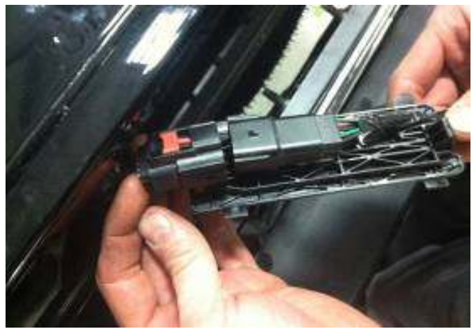
Step 3: Run the new camera harness through the opening in the back of the bed to the underside of the vehicle.

Step 2: Disconnect the harness that leads from the tailgate the under the back of the bed. There is a different plug and location for each vehicle make.