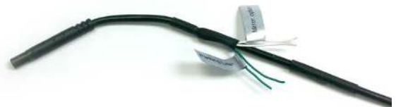
Green and White wires on the Camera Harness

Display options: Default setting is mirror image display (i.e., words and letters appear backwards as in a mirror) for rearward facing camera (rear view) installation. To change to forward facing camera (front view), connect the two white wires near the end of the camera harness.